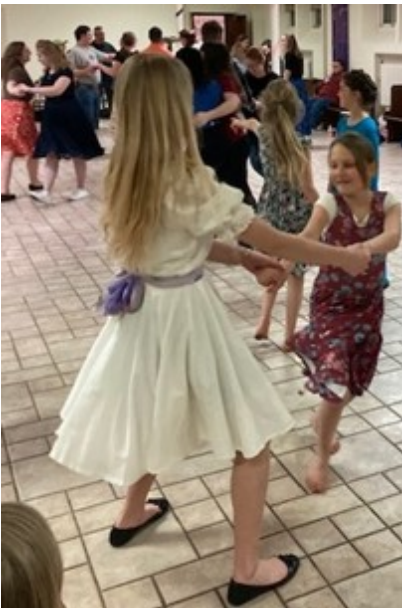
Children and adults enjoyed LMC's Spring English Contra Dance on Friday, March 25, 2022.